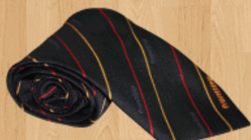
Colours to suit

Ties and Scarves to compliment any work attire in a fashionable range of styles and colours. Adding a fresh touch to your company