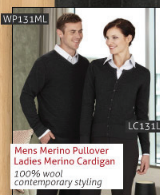
WP131ML Mens Merino Pullover Ladies Merino Cardigan 100% wool contemporary styling

knitwear / suits shirts / blouses jackets / unisex