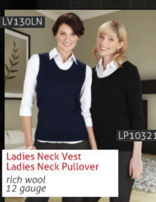
LV130LN Ladies Neck Vest Ladies Neck Pullover rich wool 12 gauge